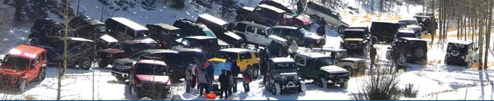
Larimer County Four Wheel Drive Club - “The Mountaineers”